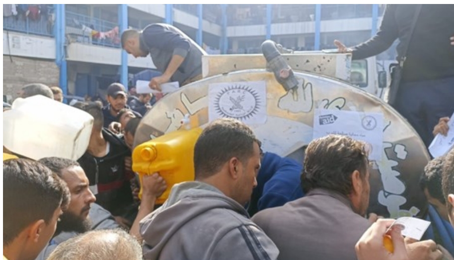
A water distribution by Christian Aid partners in northern Gaza.

Thank you too from Commitment for Life , who have received just over £1000 from us recently and want to thank the congregation. Commitment for Life is the U.R.C.'s global justice programme. Seventy-five percent of any donation goes to Christian Aid, 5% to Global Justice Now and 20% is held by Commitment to Life to cover costs but in practice much of this money ends up being given for the work of these organisations. One area being supported is Israel and the occupied Palestinian territory.